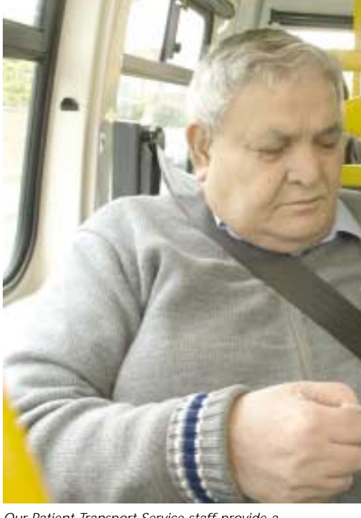
Our Patient Transport Service staff provide a helpful and reassuring service to their patients

In 2002, we became the first ambulance service in the UK to offer people who dial