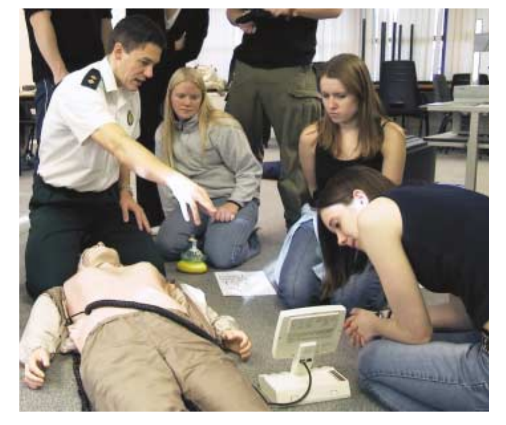
A London Ambulance Service training officer teaches cardio-pulmonary resuscitation to students at the University of Hertfordshire