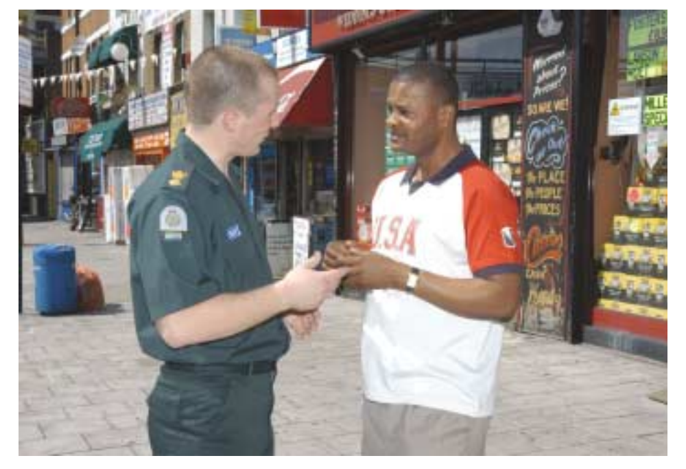
We worked with the Three Boroughs Refugee Team to build links between ambulance staff and refugee communities

During the year, we improved our staff training on equality and diversity issues by including a session on our corporate induction programme and by developing a number of 'diversity champions' in our training centres.