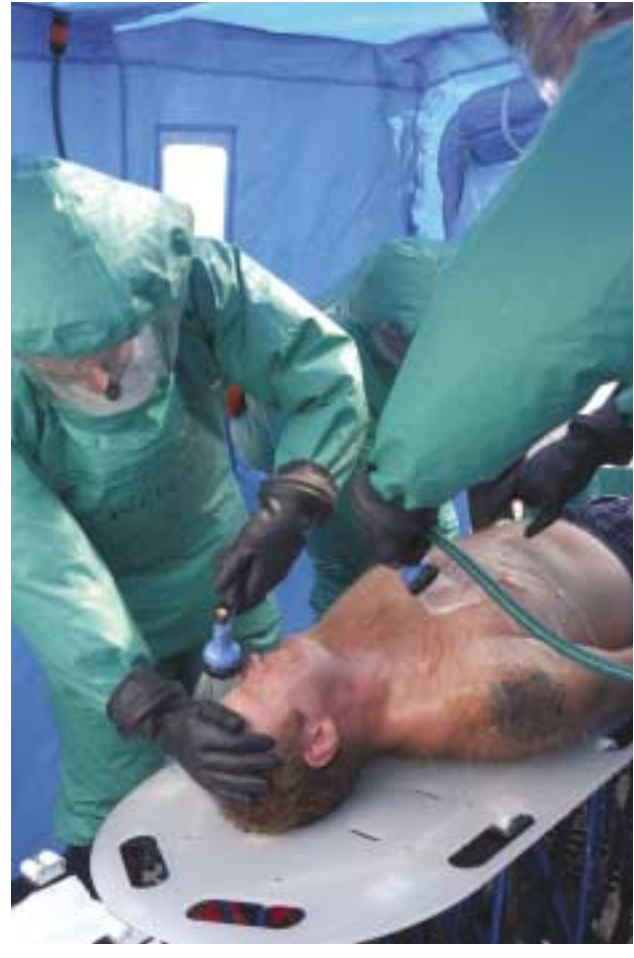
Specially-trained staff decontaminate patients who are injured in chemical incidents

Areas in which we did particularly well included meeting the Government's eight minute performance target, managing our finances and improving the working lives of our staff. Our focus on child protection issues, the introduction of 12-lead ECGs on all ambulances and participation clinical in audits all contributed to the two-star rating.