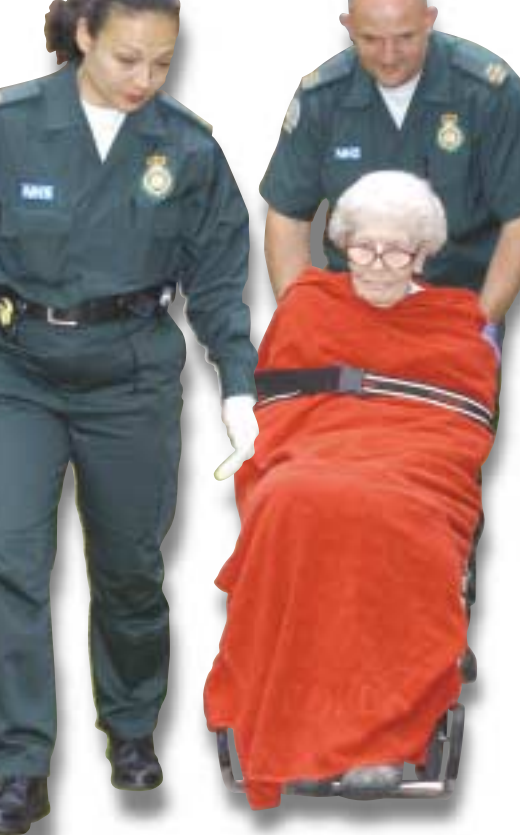
We are committed to, and actively involved in, improving the care of older people

The pilot is being externally evaluated in