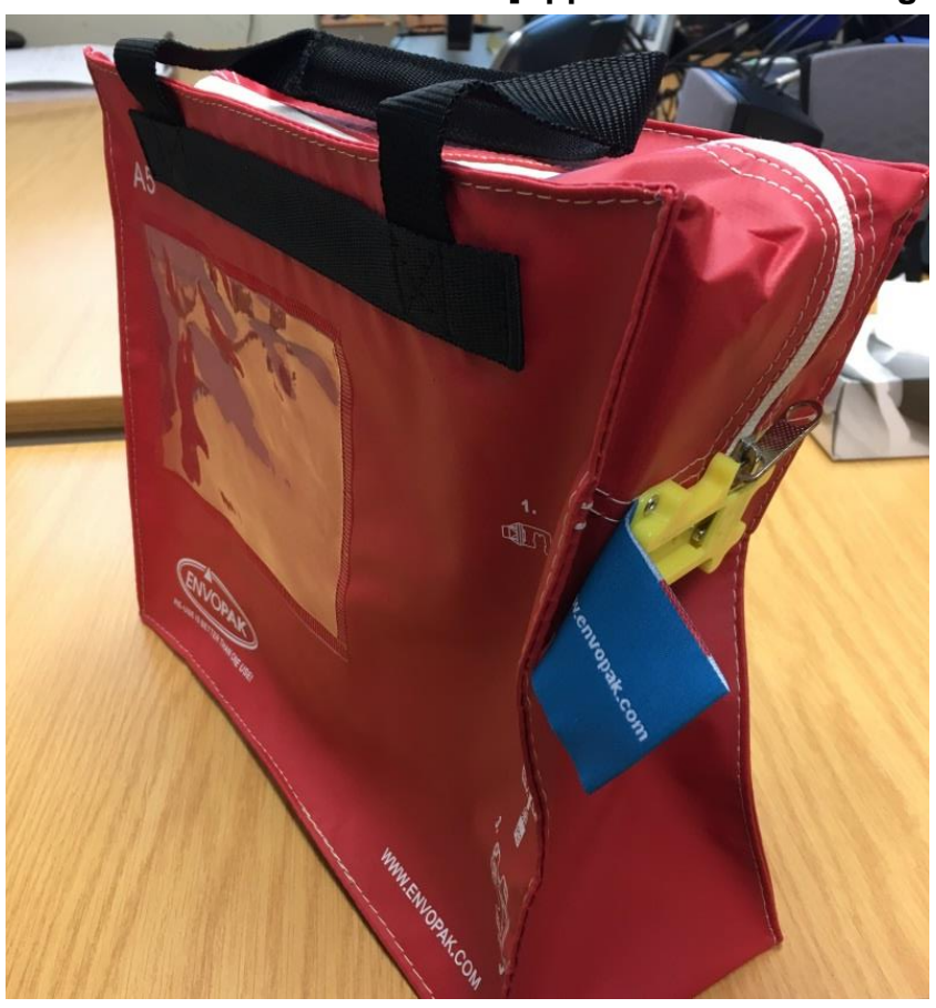
[Appendix 1 – T.E.D Bag Image and Seal Image]