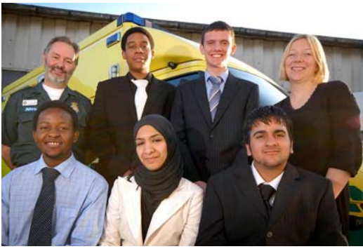
Pupils from the Warren School worked with Service staff on an 'Insight into Management' project.

Many of you felt that an important way to improve access is to raise public awareness about us, in particular educating people, and where appropriate their carers, about what to expect when help arrives. Another popular idea was to increase the amount of work we do with school children of all ages – either about dialing 999 or working for the ambulance service. It was also the first session where a lot of you suggested that we should consider charging people who call for an ambulance when they may not need one.